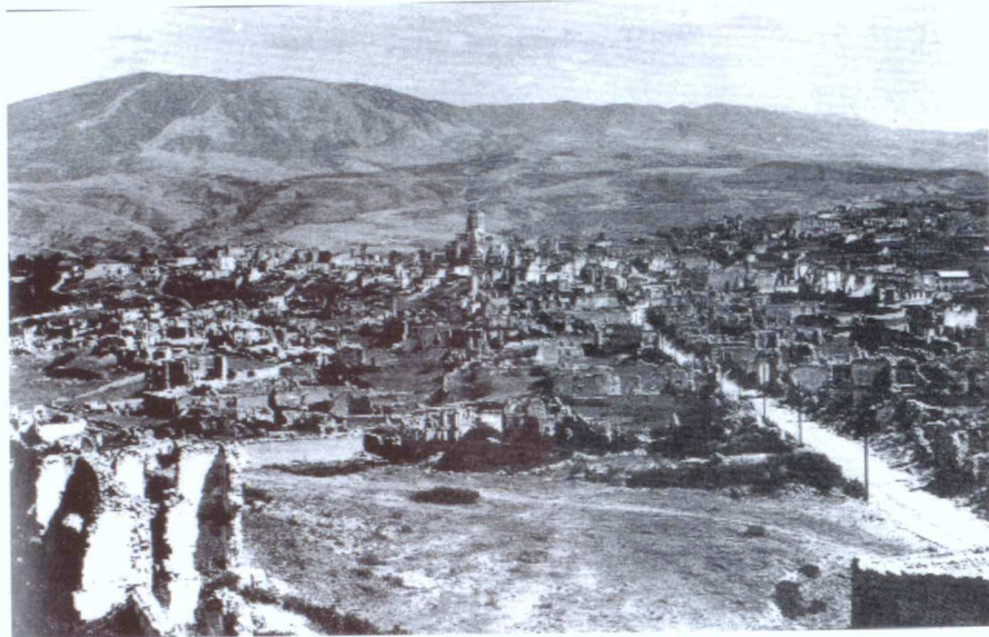
The Armenian quarters and streets destroyed by the Turk-Azeries, Shushi, March 23, 1920