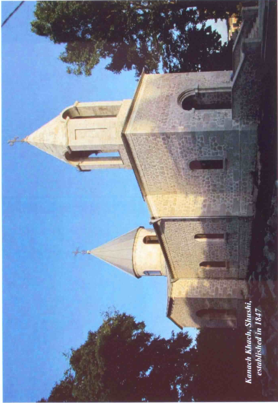
Kanach Khach, Shushi, established in 1847