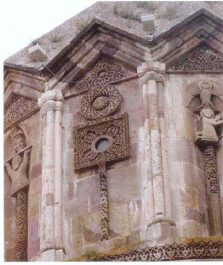
Gandzasar, Cathedral of St. John the Baptist, XIII century