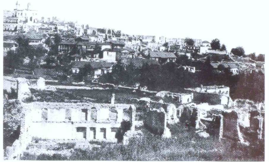
The Armenian quarters and streets destroyed by the Turk-Azeris, Shushi, March 23, 1920