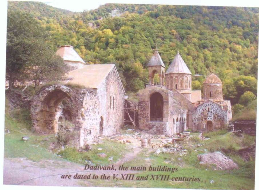
Dadivank, the main buildings are dated to the V, XIII and XVIII centuries